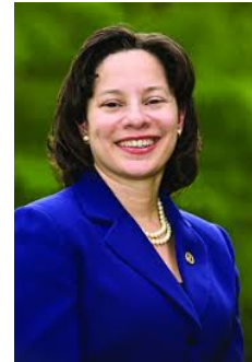
Senator Jennifer McClellan