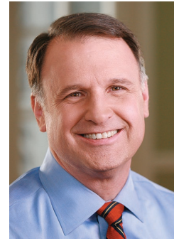
Senator Creigh Deeds SB1478