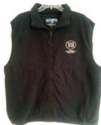
Inner Harbor Men's Full Zip Fleece Sleeveless Vest Navy Blue with Khaki Embroidery $35.00