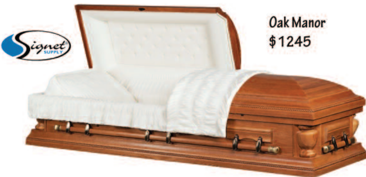
Oak Manor $1245

Solid oak casket with almond velvet interior.