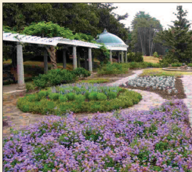
Maymont Gardens, Richmond

Meetings are held on the 2nd Tuesday in January, March, May, July, September and November.