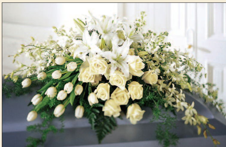
Meeting and Installation held in June during annual convention.