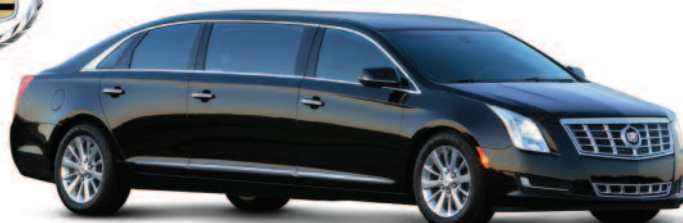
Ambassador Six Door by Federal Coach