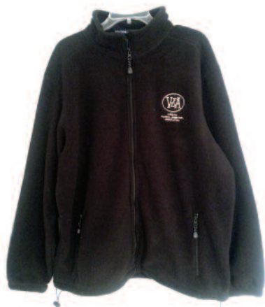
Devon & Jones Men's Full Zip Fleece Jacket Black with Khaki Embroidery $40.00