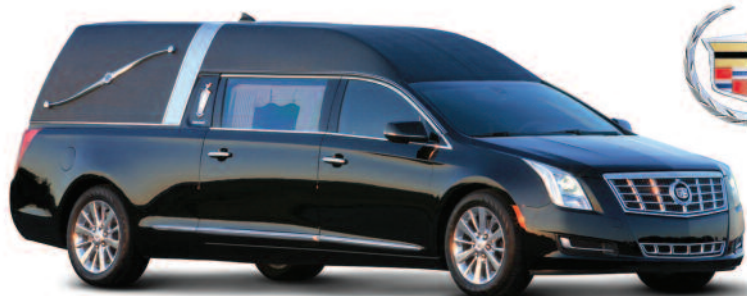
Heritage Hearse by Federal Coach

New Cadillacs and Lincolns, Previously Owned Limousines, Hearses and Vans