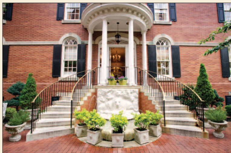
Morrison House, Alexandria

Meetings are held on the first Wednesday in March, June, September and December.