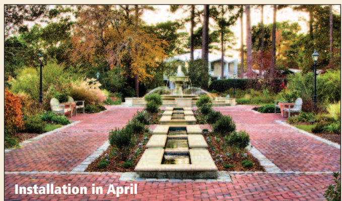
Norfolk Botanical Gardens

H.D. Oliver Funeral Apts., Norfolk digger9822@aol.com or hdofh@aol.com