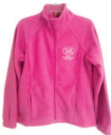
Harriton Ladies' Full Zip Fleece Jacket Charity Pink with White Embroidery $30.00