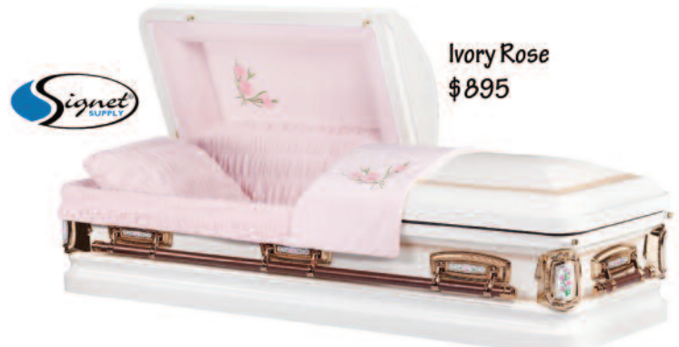
Ivory Rose $895

Solid oak casket with almond velvet interior.